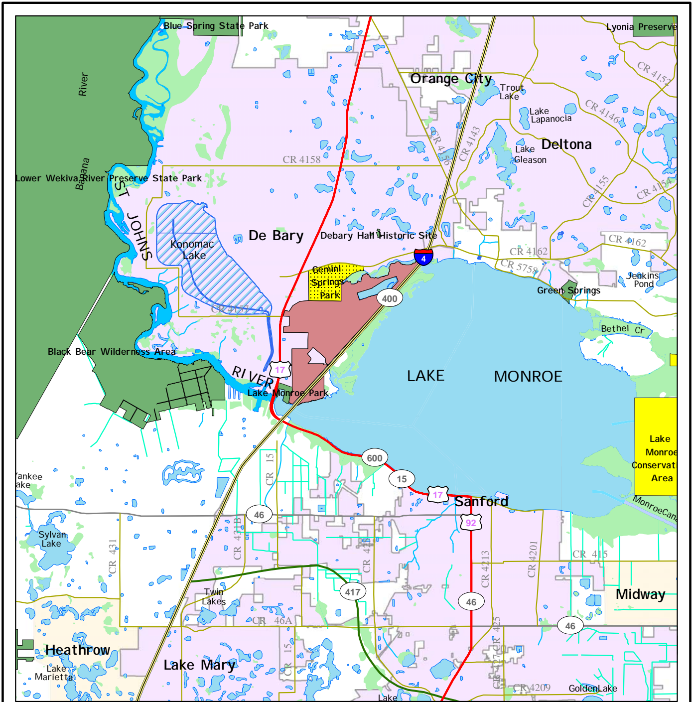
Gemini Springs Addition Figure 1: Location Map